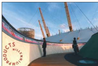
(Above) The Spiral of Innovation, featuring FireFace among some of the 1,012 Millennium Products selected by the Design Council.