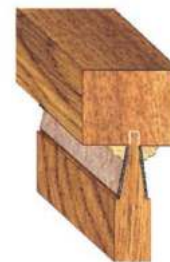
FireFace on raised / fielded panels