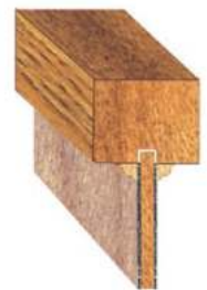
FireFace on flat panels