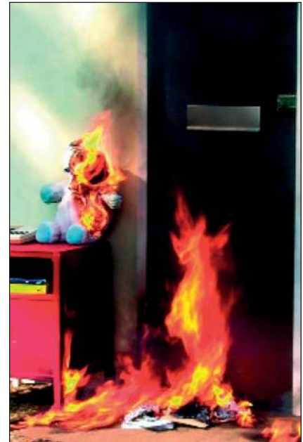
Unprotected letterbox fire

Use the flexible firebag (illustration 3) in situations where doors open tightly onto walls, allowing full door opening.